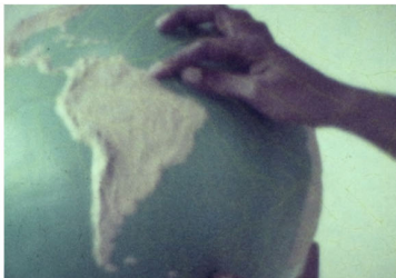
3 film stills

I am interested in the experimental essay film because it gives me the freedom of not following linear structures and it foregrounds the process of thought and the labor of constructing a narrative rather than aiming for seamless artifacts that conceal the conceptual questions that went into their making. Incompletion, loose ends, directorial inadequacy: these are acknowledged in the essay film rather than brushed over. 1